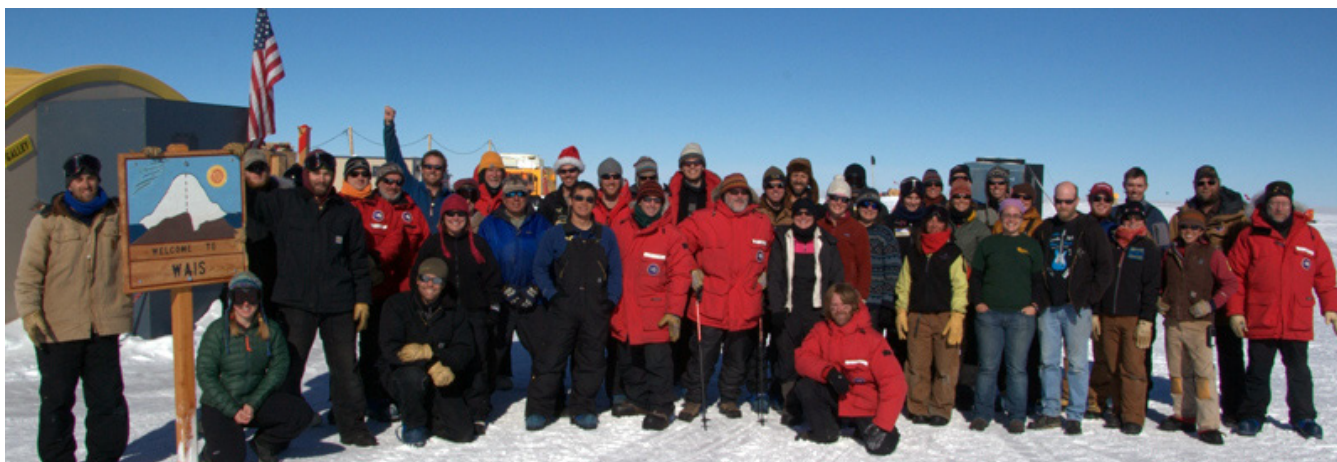
2009/2010 Field Team.

The camp had a monotonous rhythm set by the 2.5-hour cycle it takes to recover each 3 m segment of ice core. But there was always something interesting going on, a new friend to share a meal with, a talk/slide show to attend, a ski with a friend, the Winter Olympics, coffee house entertainment, a charity raffle, dazzling light shows in the sky. It never slowed down and everyone pulled together as a single team.