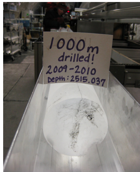
With only 34 days of drilling, and drilling 24 hours/day, the 2009/2010 Field Team was able to recover more than 1000 meters of ice (1049 meters to be exact).

RPSC opened the camp on November 1 and provided the logistics that were the base of the operation. A set of storms reminded the put-in crew where they were and kept the IDDO drilling and NICL and SCO science crews away until November 28, which was 10 days later than planned. RPSC worked through some Sundays and postponed some work allowing us to make up some of the lost time. The SCO and NICL crew opened the arch and packed up the kilometer of brittle (and some ductile) ice that was stored in the basement. Drilling operations started on December 11 and routinely produced 30+ m per day of perfect 3+ meter long cores. At these depths the gas bubbles have been forced into the ice lattice, making the ice almost glass clear. The cores occasionally had bands of volcanic ash, some razor sharp, others diffuse, that served as welcome treats. By working many Sundays and reducing the time required to take down the camp, we were able to make up for the lost time and meet our depth goal for the season.